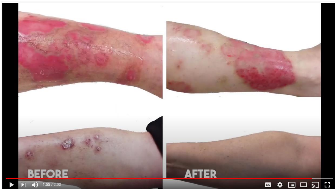
How to use Primocyn Eau Divine